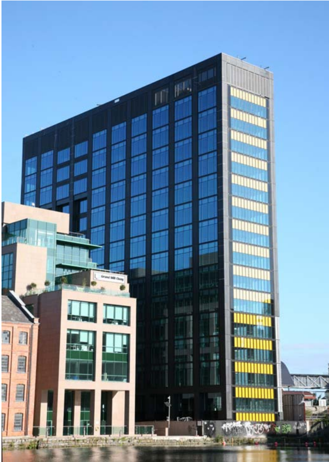
Water view of Montevetro